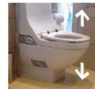
↑ ADJUSTABLE HEIGHT

Geberit Sales Ltd • Geberit House • Edgehill Drive • Warwick • Warwickshire • CV34 6NH Tel +44 (0)1926 516900 • Fax +44 (0)1926 400101 • Email enquiries@geberit.co.uk www.geberit-aquaclean.co.uk/care