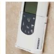
↑ PERSONALISED COMFORT