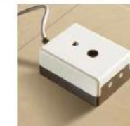
↑ TOUCH-FREE OPERATION

→ For additional information or advice contact: