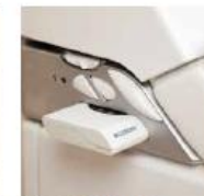
↑ TOTAL CONTROL