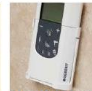
↑ PERSONALISED COMFORT