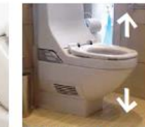
↑ ADJUSTABLE HEIGHT

Geberit Sales Ltd • Geberit House • Edgehill Drive • Warwick • Warwickshire • CV34 6NH Tel: +44 (0)1926 516800 • Fax: +44 (0)1926 400101 • Email: enquiries@geberit.co.uk www.geberit-aquaclean.co.uk/care