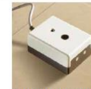
↑ TOUCH-FREE OPERATION

→ For additional information or advice contact: