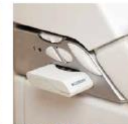
↑ TOTAL CONTROL